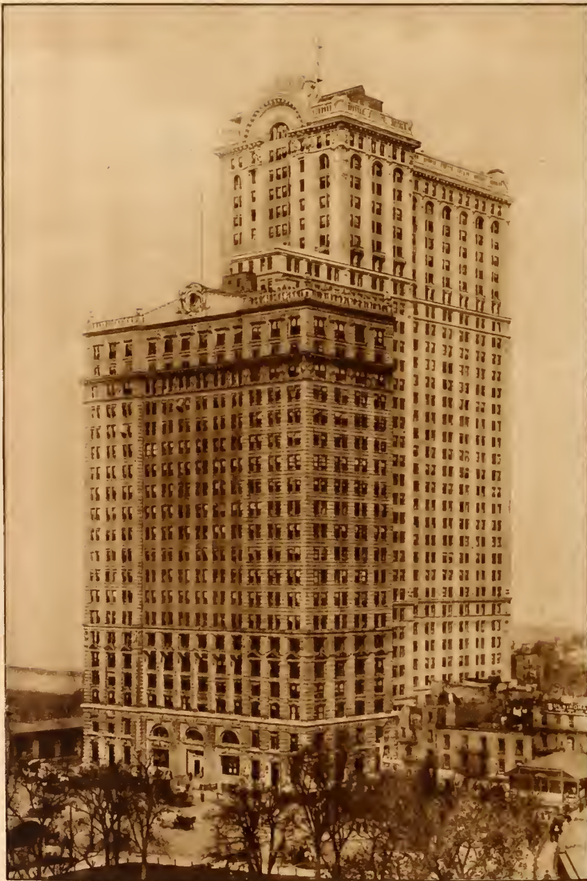
WHITEHALL AND WASHINGTON BUILDINGS. Twin buildings covering 21 city lots and are the home of the weather bureau and Millionaires' Club.